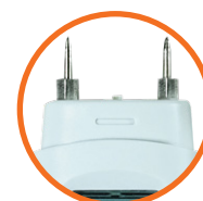
Integral Electrode Pins

MT962 | Moisture Meter with LCD Bargraph Display