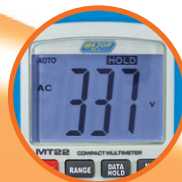
2000 Count Backlit LCD Display