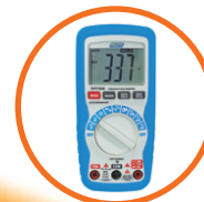
Double Moulded Rubber Housing