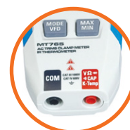
Rear entry of standard 4mm Test Lead Terminals