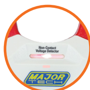
Red Light indicates detection of Non Contact Voltage (NCV)