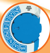
Illuminated functions for easy selection in dimly lit areas