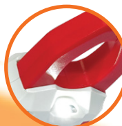
Meter includes flash light to light up area of test

MT765 | 600A AC Clamp Meter with IR Thermometer