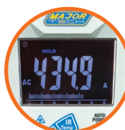
6000 Count Backlit Negative Colour Display